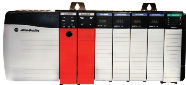
Allen-Bradley GuardLogix Safety Controller