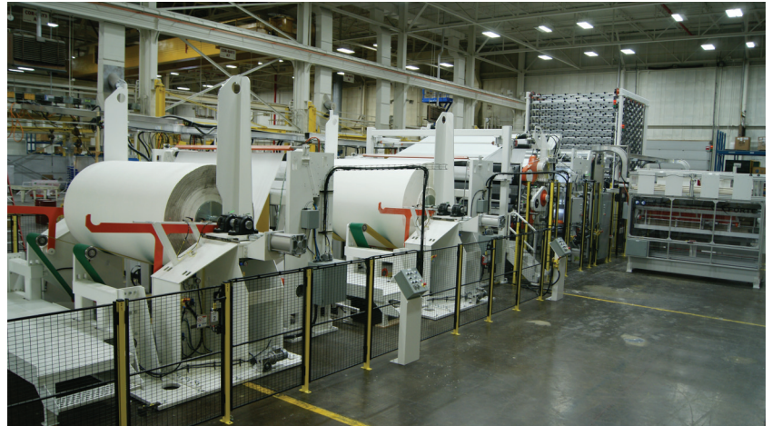
PCMC makes functional safety an integral part of the design process across its portfolio and in upgrades.

Safety is a critical factor across the industrial landscape. But while reducing risk on the plant floor has been a constant for more than a century, safety standards have undergone a global transformation in recent years.