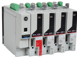
Allen-Bradley Kinetix 6500 EtherNet/IP-Enabled Servo Drive