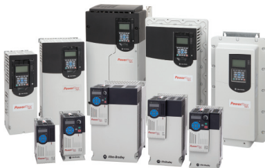
Allen-Bradley PowerFlex AC Drives